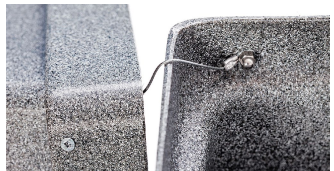
LIDS TETHERED TO BODY ON OUTDOOR UNITS *SOME ASSEMBLY REQUIRED