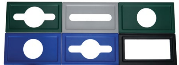
VARIETY OF LID OPENING & STAMPING OPTIONS