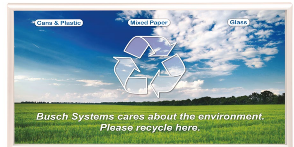
Custom Signage Available