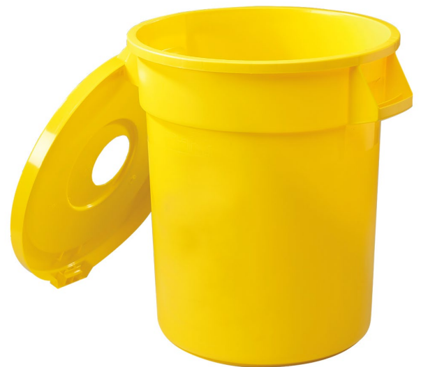
Various color and lid options available