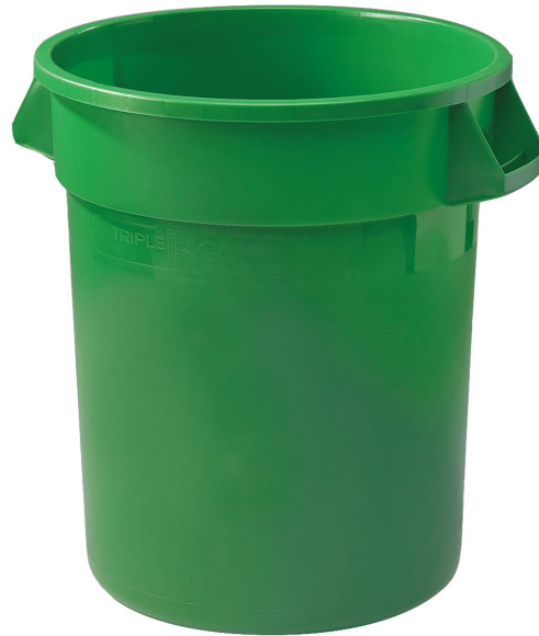
*Kelly Green shown