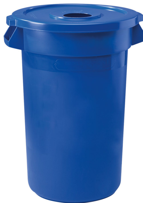
Various color and lid options available